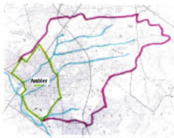
The portion of the Wissahickon Watershed that affects Ambler Borough

Borough Council has directed its manager to draft a letter to Upper Dublin, Lower Gwynedd, Montgomery County Planning Commission and the WWA requesting to begin a dialogue for a Storm Water Management Plan. Within the next several years the County Planning Commission will initiate a plan under the PA Storm Water Management Act 167 for the entire Wissahickon watershed. Because Act 167, in its present form, deals with storm water coming from new development it does not apply to the nearly built out Wissahickon watershed. This is why the County Planning Commission has put it on hold until criteria can be set up that will make a difference to the Wissahickon. Unfortunately, storm water problems will continue to occur in the interim. Talks with fellow stakeholders was recommended by a watershed specialist so