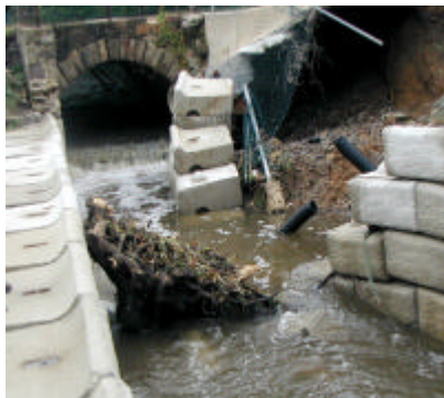
Creek Damage at Ridge Avenue